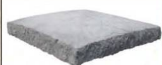
Courtyard Post Cap