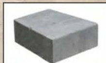
Courtyard Wall Cap