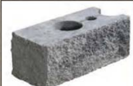
AB Courtyard Corner