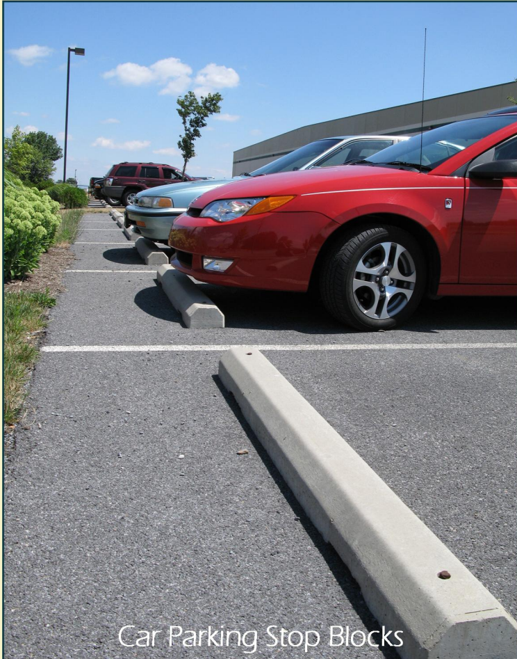
Car Parking Stop Blocks