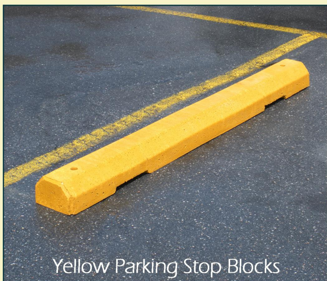
Yellow Parking Stop Blocks