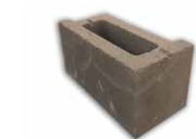
AB Aztec Corners