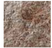
* Birch Blend