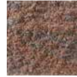
* Emerson Blend