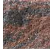
* Rustic Blend