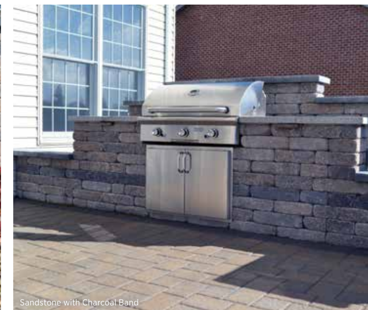
Sandstone with Charcoal Band