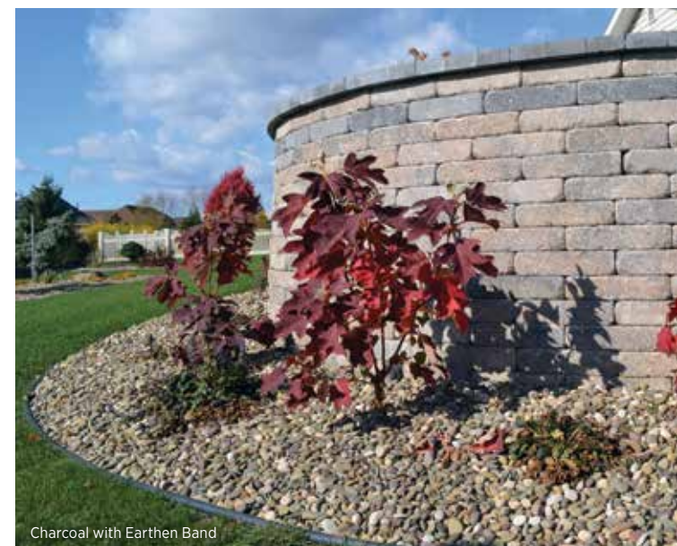
Charcoal with Earthen Band