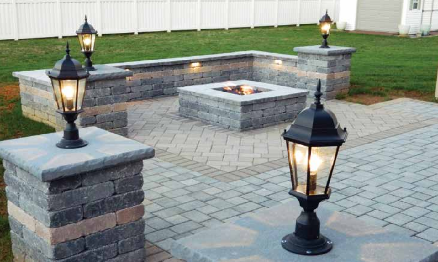
Charcoal with Earthen Band