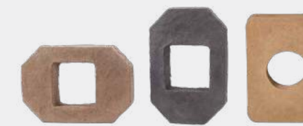
LARGE OUTLET BOX/ LARGE ROUND LIGHT BOX