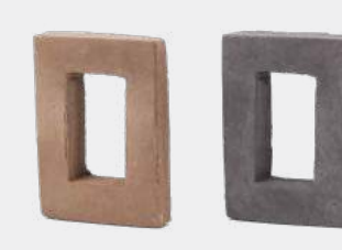
SMALL OUTLET BOX