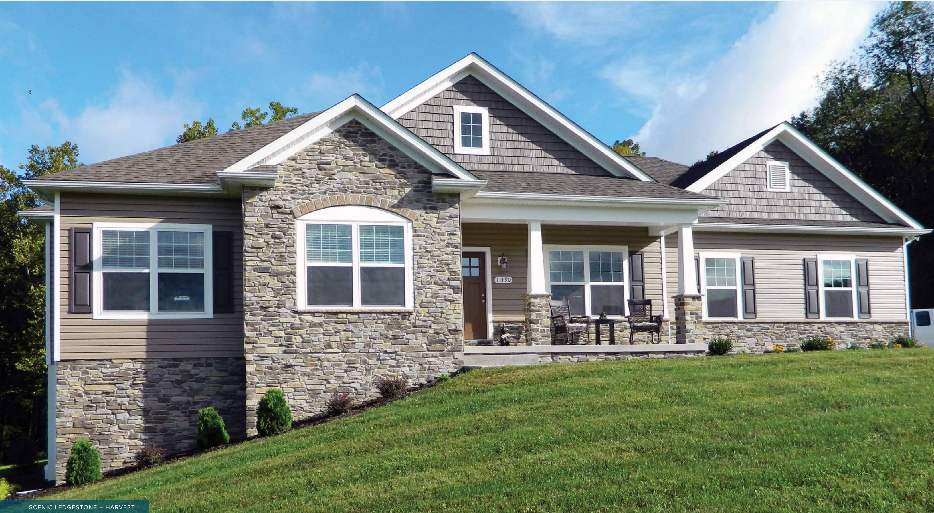
SCENIC LEDGESTONE – HARVEST