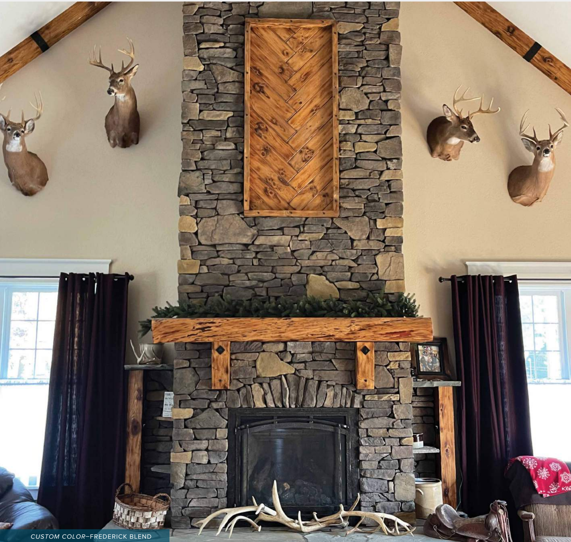
CUSTOM COLOR—FREDERICK BLEND