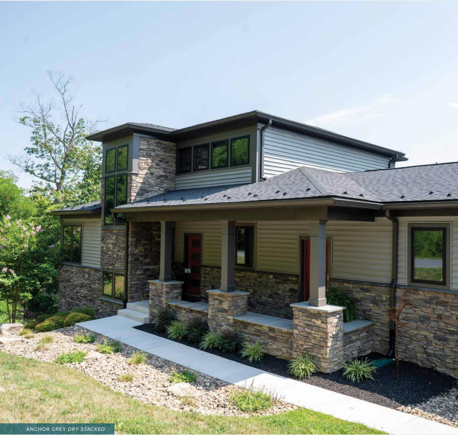
ANCHOR GREY DRY STACKED