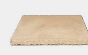
CHATHAM POST CAP